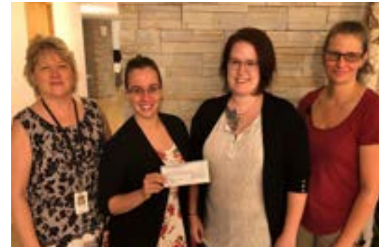
ARCH Team with 2019 BscN students with their Club Chapter donation.

Thank you to OPSEU Local 605 for their donation of $200 towards providing quality, compassionate end-of-life care to Algoma District