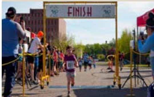
Participants crossing the finish line at Run The Great Lakes event.

The Machine Shop held the ARCH Hospice 3rd Annual Pancake Breakfast. Thanks to the unbelievable support and dedication from everyone at The Machine Shop and the community. The event was a huge success and raised $13,439 for ARCH Hospice!