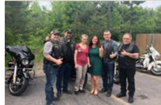
ARCH Team members with Widows Sons Algoma East Chapter local riding group.

Thank you to everyone who attended the Second annual Great Bucket List Ball! Your contribution helped us raise $26,520. Such a fun night out with live music by the Reptiles, live bucket listing, and delicious meal by our gracious host at the Machine shop!